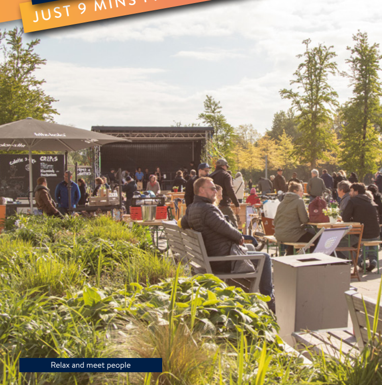
Relax and meet people