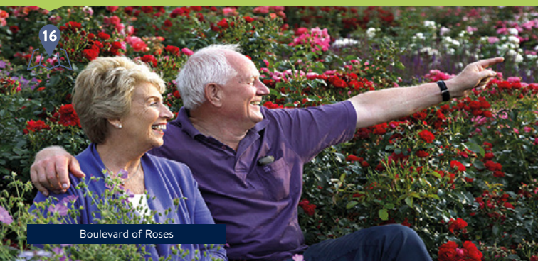
Boulevard of Roses