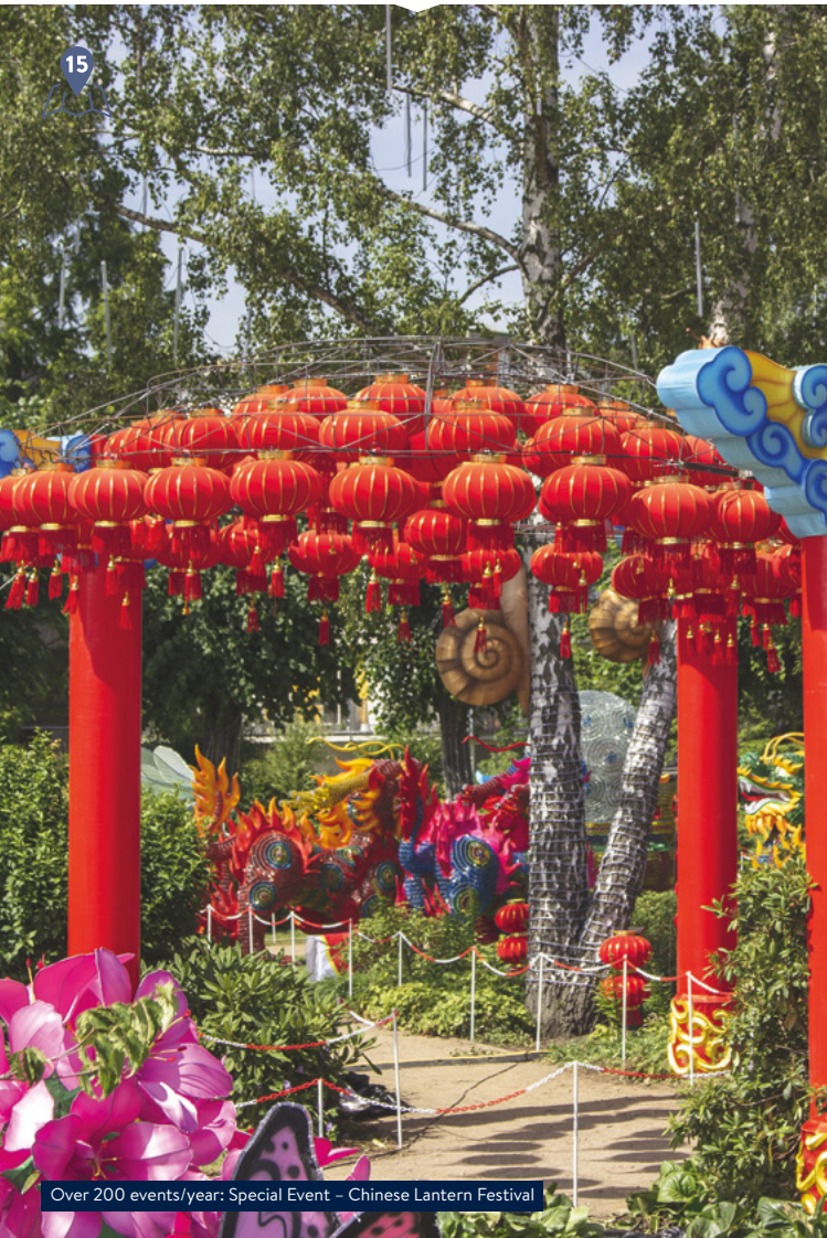
Over 200 events/year: Special Event – Chinese Lantern Festival

Despite of all the hustle and bustle, you will always find a quiet place to soak up the fresh air, to relax and unwind.