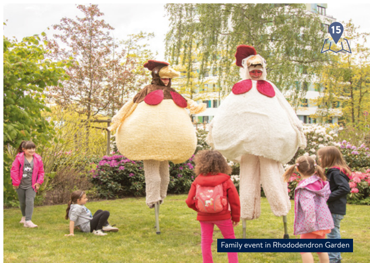
Family event in Rhododendron Garden

Japanese Elm, Chilean Araucaria and Caucasian Walnut - this garden pays tribute to Hamburg’s international flair. It features thirty different trees, all sponsored by consulates located in the city.